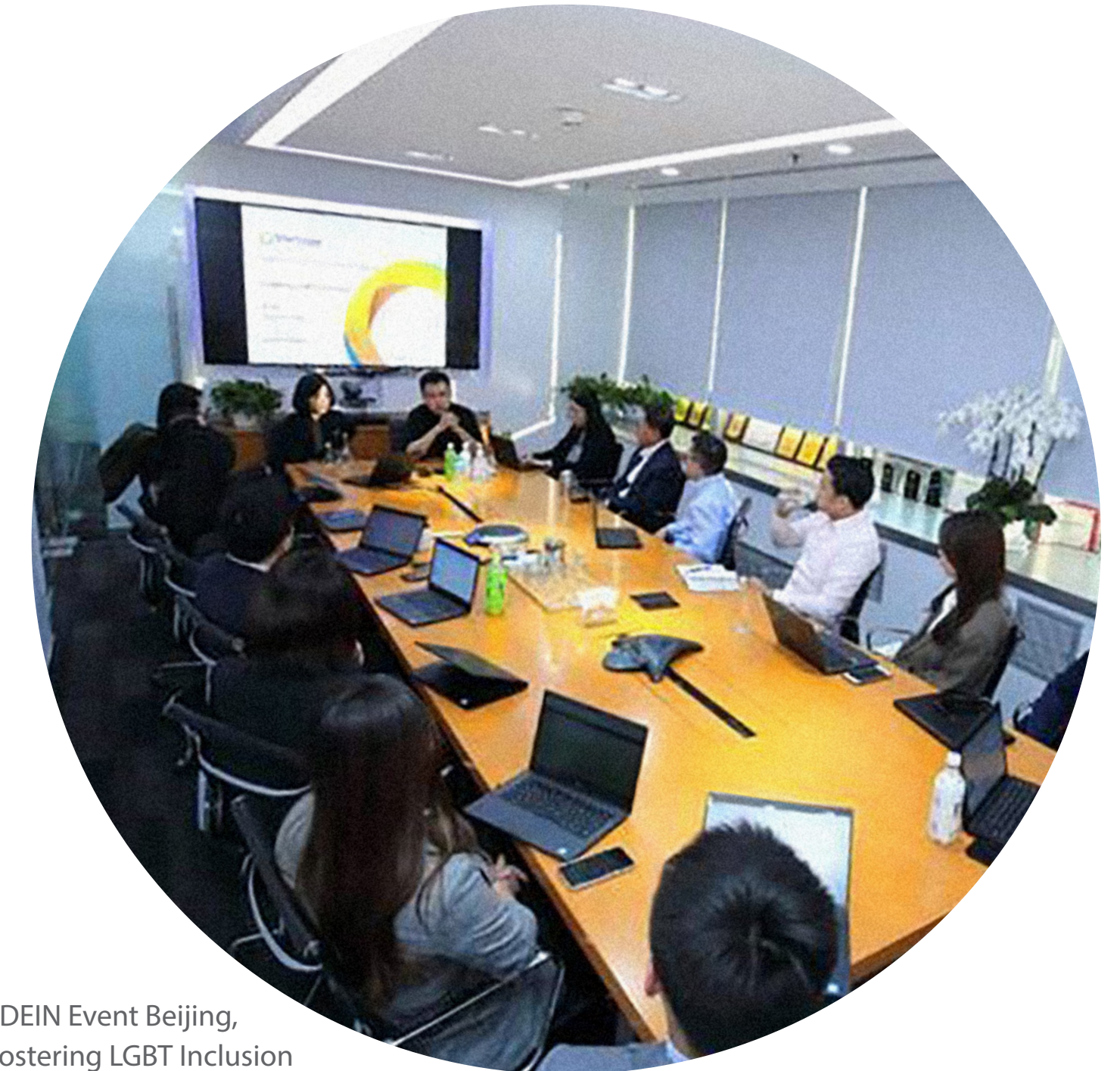
SDEIN Event Beijing, Fostering LGBT Inclusion

In 2021, we welcomed 277 new employees across our 23 global offices. 130 of these employees joined us as part of the acquisition of Greenspring Associates, a leading venture capital and growth equity platform.